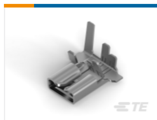
TE Part # 2238171-3 250 FASTON, FLAG, REC., 22-12 AWG, TPBR