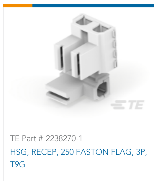
TE Part # 2238270-1 HSG, RECEPT, 250 FASTON FLAG, 3P, T9G